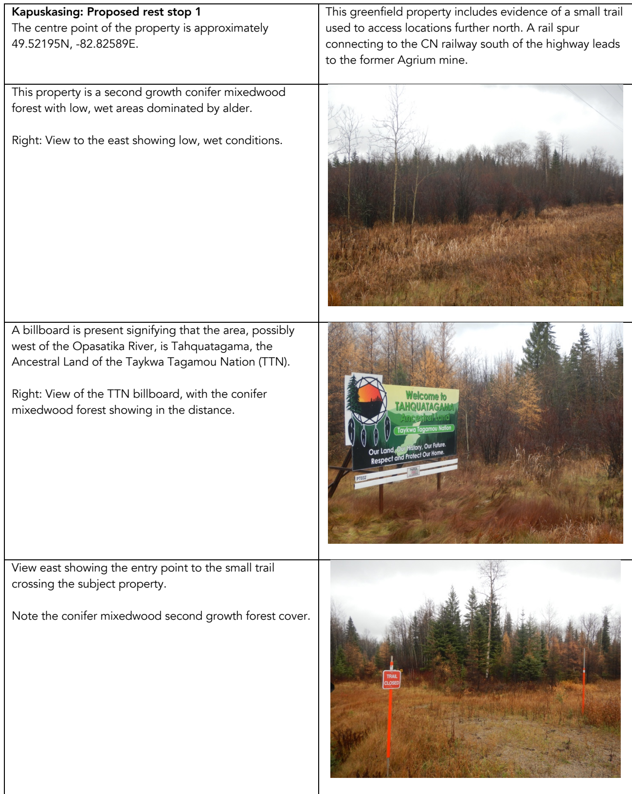
Table 1: Conditions and descriptions of the proposed rest stop areas.