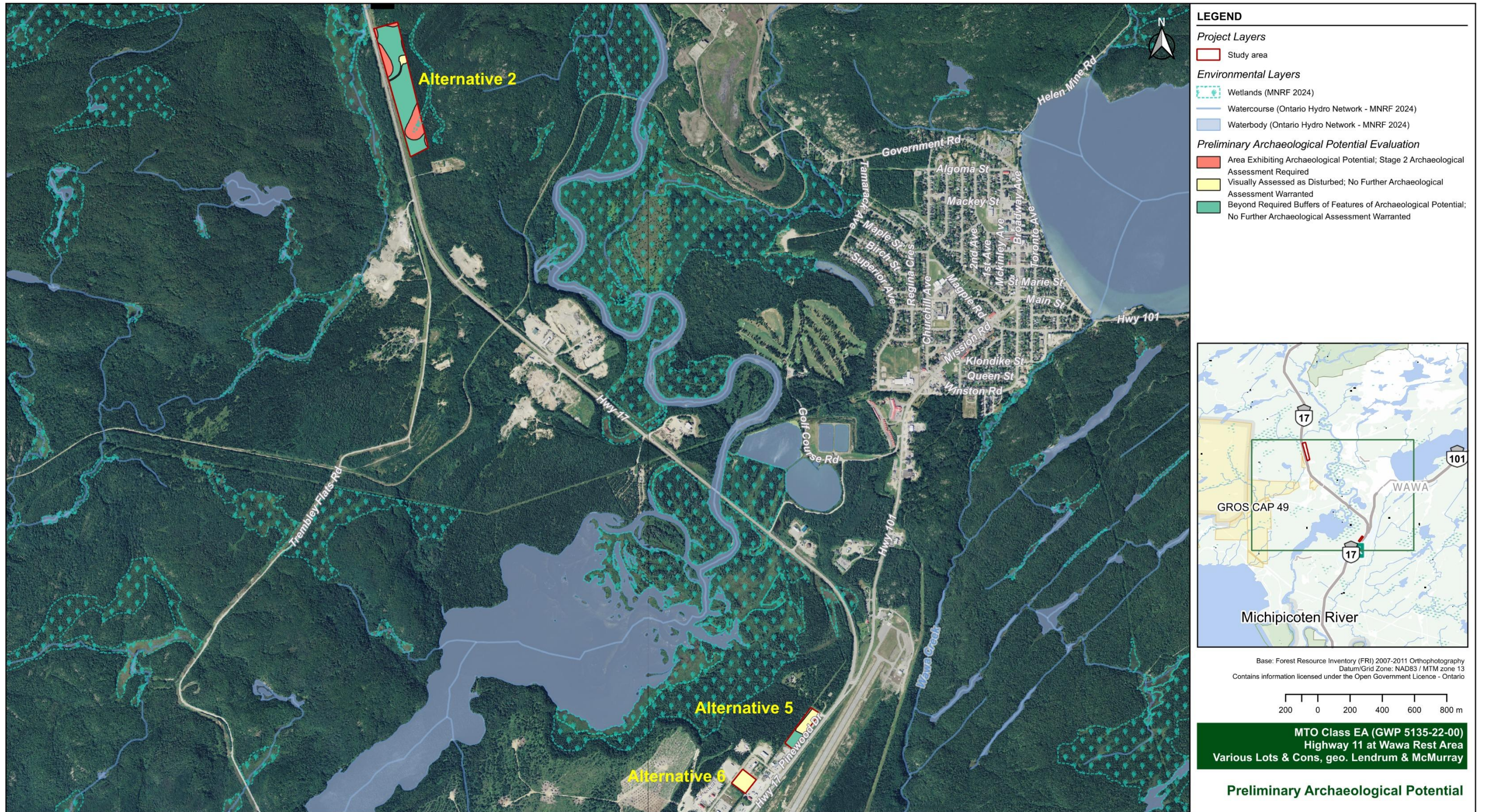
Figure 1. Preliminary archaeological potential determination for the three Wawa alternatives.